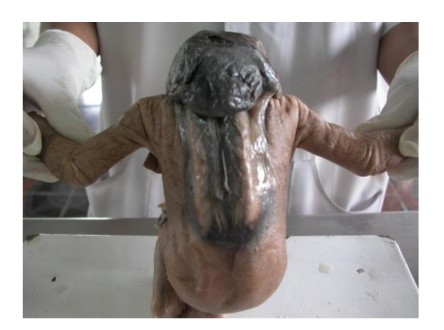
Fig.2 Showing Split Spinal Cord And Spinal Nerves In Malformed Vertebral Column

A still born female foetus with sacral meningocele is deliverd by a female of 32 years at 34 wks of getation. The foetus presented a scaral meningocele containing fluid filled cyst without the involment of spinal cord.(fig.3)