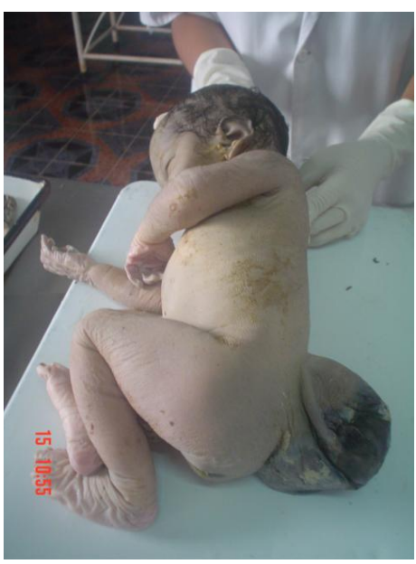
Fig.3 Showing Sacral Meningocele

A still born female foetus with sacral meningocele is deliverd by a female of 32 years at 34 wks of getation. The foetus presented a scaral meningocele containing fluid filled cyst without the involment of spinal cord.(fig.3)